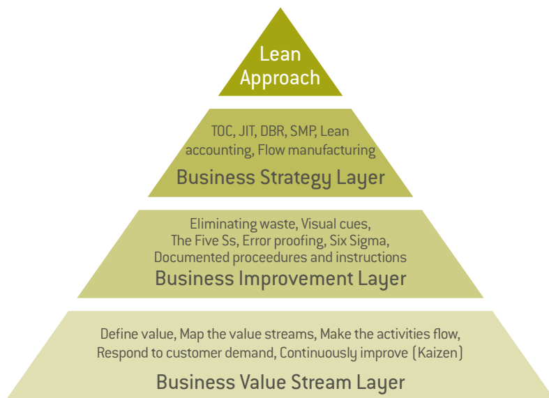
Figure 1. Lean as a holistic approach requires discipline and attention to each layer of the lean philosophy, including the value stream, business improvement and an applied business strategy.

From a more formal perspective, lean has been defined through a variety of methodologies, tools and practices that can be considered essential to a lean initiative. Companies typically adopt one or more of these formal practices thinking they are now operating in a lean fashion. Unfortunately only adopting individual elements of lean will produce isolated improvements rather than long term results. Given that many lean concepts have originated from the Japanese culture, where balance, harmony, discipline, and group organization are central themes, it is not enough to only use the vocabulary and individual elements of the philosophy. It is the sum total of the elements and the synchronized relationship to one another that make them most effective. Likewise, it is the use and adoption of lean beyond one department such as manufacturing production control that make a lean initiative most effective. Rolling out an enterprise wide lean initiative can be viewed as having three essential layers: The business value stream layer, the business improvement layer, and the business strategies and tools layer.